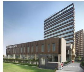
PARAS TRINITY Delivered

In over a decade since its inception, stability and timely delivery have become hallmark of Parus Buildtech. In this span, the company has delivered approx. 6.5 million sq. feet and is working on multi scale projects.