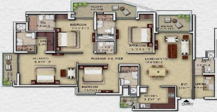
4 BHK + SERVANT TYPICAL UNIT PLAN

TOWER D SUPER AREA 2355 SQ. FT CARPET AREA 1403 SQ.FT BUA 1535 SQ.FT