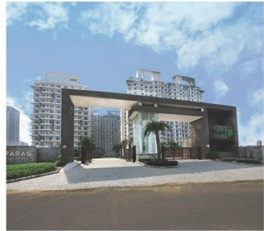
PARAS IRENE Delivered