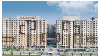
PARAS SEASONS Delivered