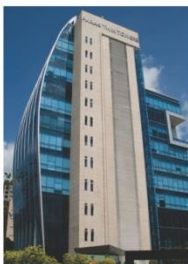
PARAS TWIN TOWERS Delivered