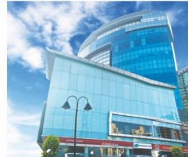
PARAS DOWNTOWN CENTER Delivered