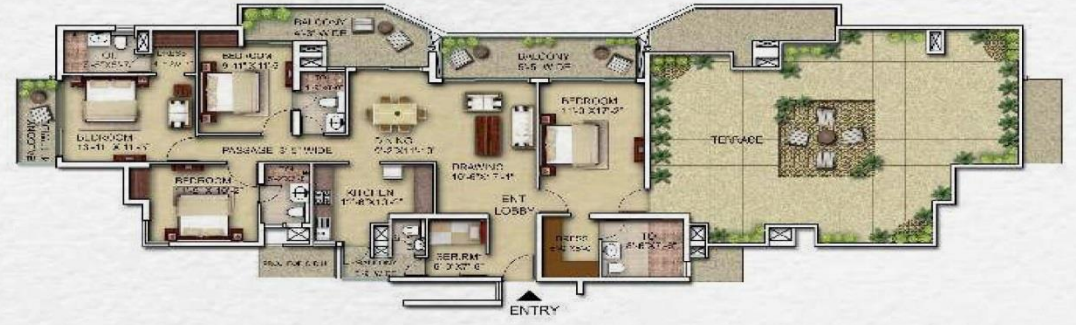
PENTHOUSE TYPICAL UNIT PLAN

TOWER D SUPER AREA 4150 SQ. FT CARPET AREA 1510 SQ.FT BUA 1660 SQ.FT