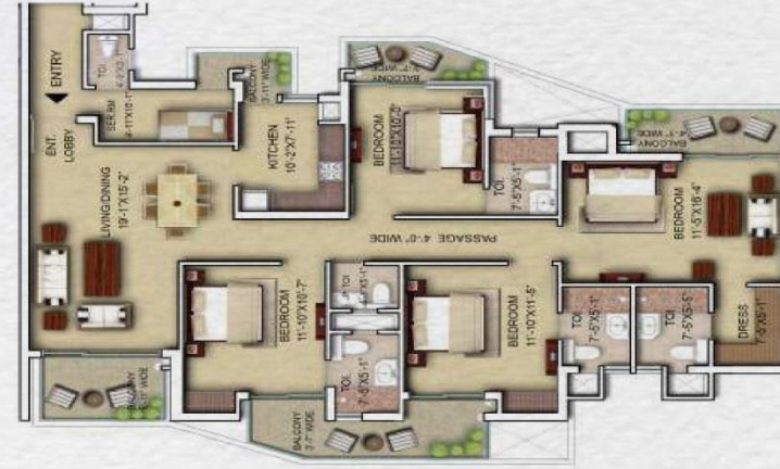
4 BHK + SERVANT TYPICAL UNIT PLAN

TOWER D SUPER AREA 2355 SQ. FT CARPET AREA 1403 SQ.FT BUA 1535 SQ.FT