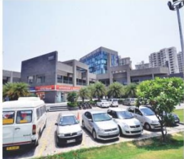
PARAS TRADE CENTRE Delivered