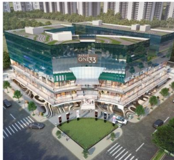
PARAS ONE33 On going